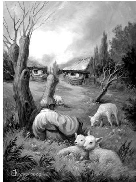
Fig. 12. I passed thirteen... Ambiguous by Oleg Shupliak [14]

Optical illusions are attractive art form and have the potential for use in modern life, particularly in Lviv. In an