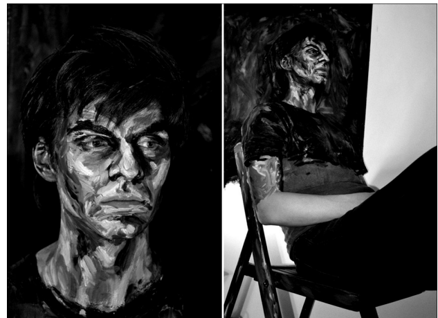
Fig. 14. Reverse 3D images by Alexa Meade [1], [15]

urban environment and can use the exterior street art, art installation in the air, surrealism. We offer to use surrealism on ashen walls from trivial round houses that will certainly be positively perceived by local residents, will bring color and a certain philosophical sense in building. In particular, use of or offer us a famous surrealist and contemporary Ukrainian Oleg Shupliak. The interior - use spatial installations, shady, angular