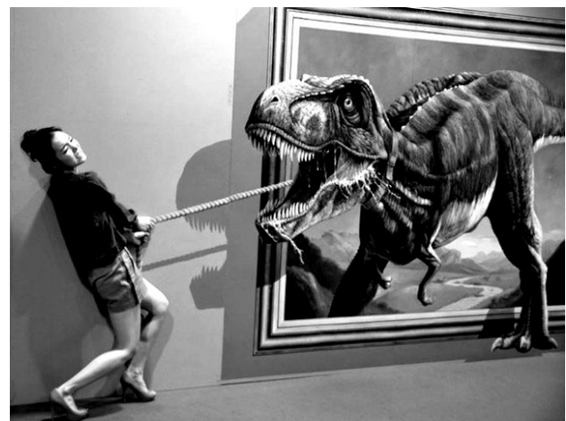
Fig. 9. Gallery anamorphosis Magic Art Special Exhibition Of China [4]

❖ gallery anamorphosis (3D image through shadows and create a certain point of view 4D effect) (fig. 9);