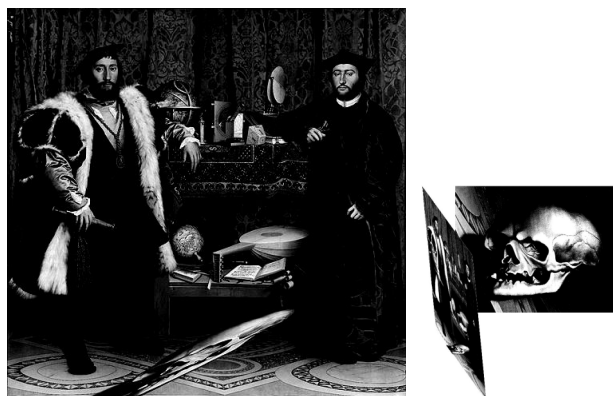
Figs. 1 and 2. «The ambassadors». Hans Holbein, 1533 p. [8]

One of the earliest well-known anamorphic art is work by Hans Holbein «The ambassadors». In the foreground of the painting shows a human skull, which takes readable form, examine it only if the right side and at a certain angle (figs. 1 and 2).