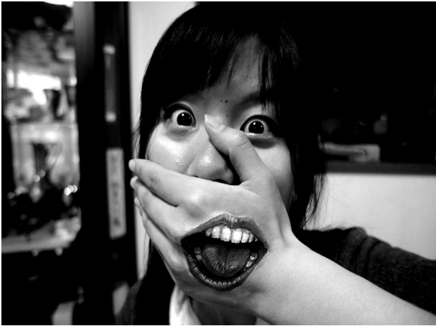
Fig. 15. Body art illusion "surprise, which can not hide" by Hikaru Cho [16]

illusion of body art gallery and anamorphosis. We propose to use gallery anamorphosis in children's clinics: many times we watched as children exhausted long queues, and such a non-standard course can interest both children and parents, moreover, this will allow to inure love for art since childhood.