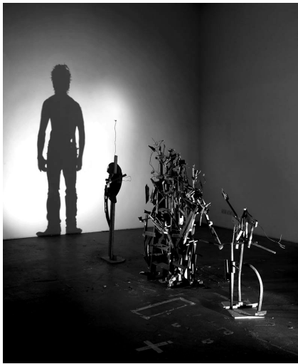
Fig. 4 . Shadow installation Tim Noble & Sue Webster [10]