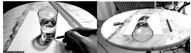
Fig. 8. Anamorphosis on paper Stefan Pabst [3]

❖ anamorphosis on paper (3D pictures on paper). Representatives: Sandor Vamos (Hungary), Ramon Bruin (Netherlands), Stefan Pabst (Germany). Authors works with pencils on sheets of paper, adding to his drawings such items that make the viewer it's difficult to understand where the real world ends and begins a fictional picture (fig. 8);