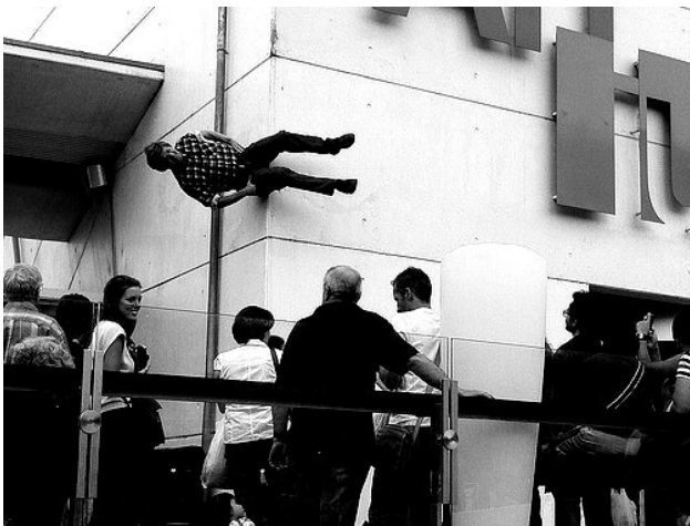
Fig. 11 Art installation in the air by Johan Lorbeer [13]

❖ art installation in the air (installation becomes supernatural features, as not seen the object support and the object appears to "lift" in the air). Representative: Johan Lorbeer (Germany) (fig. 11);