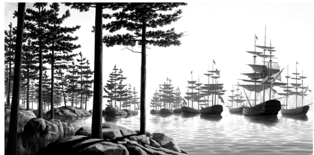
Fig. 13. Sailing Island. Surrealism Rob Gonsalves [6]