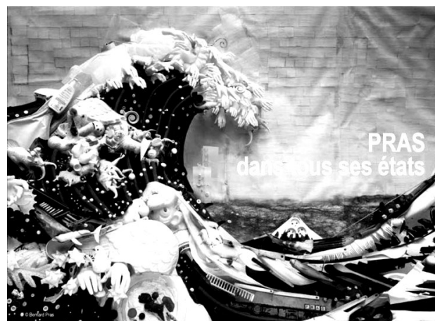
Fig. 3. Spatial installation B. Pras [9]

❖ spatial installation . Shapeless heaps of things scattered in large halls transformed into a work of art, the viewer need only look at a certain angle. Representative: Bernard Pras (France) (fig. 3);