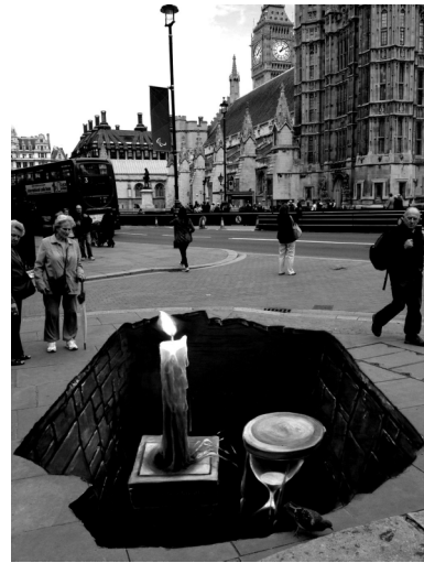
Fig. 7. Street art Nicholas Arndt [2]