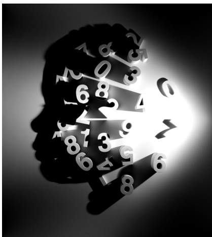
Fig. 5. Shadow installation Kumi Yamashita [11]

❖ angular illusion (distorted texts that can be read only from a specific position). Representatives: Hunter Thompson and Joseph Egan (UK) (fig. 6);